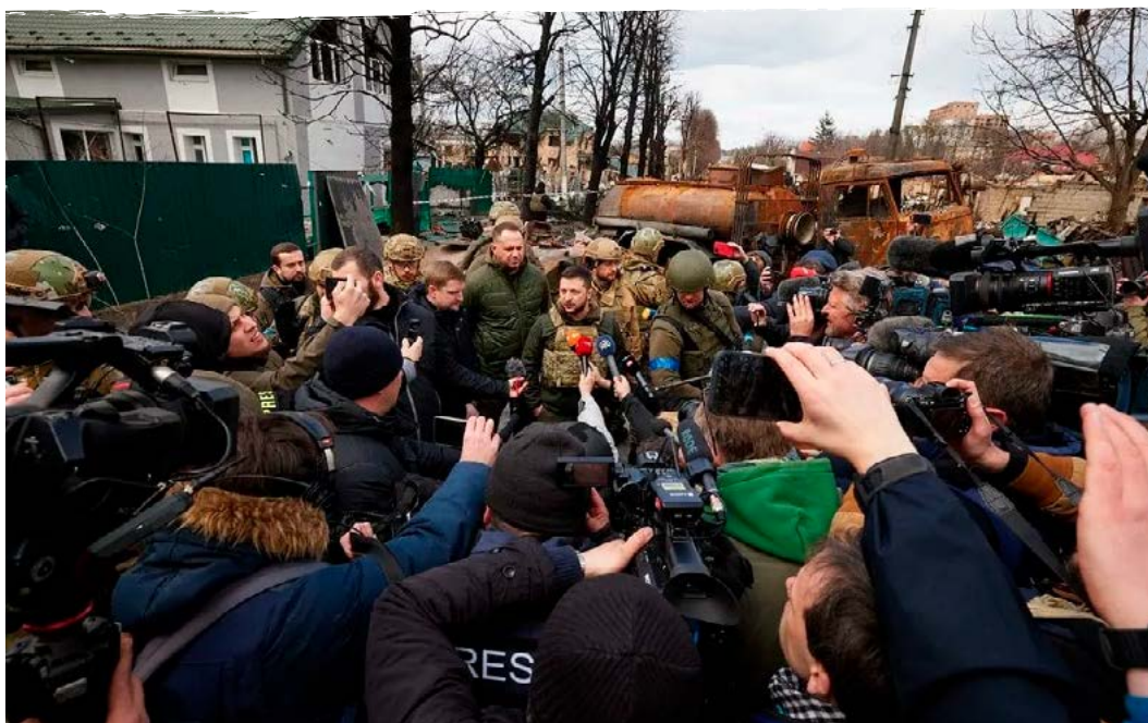
Volodymyr Zelenskyy visited Bucha, where he talked to local residents and journalists.

Experts and journalists will write about the ethical challenges of reporting conflict zones; the Ukrainian journalists struggling for impartiality; the courageous resistance of journalists in Russia; and the impact of social media and disinformation on coverage of the conflict.