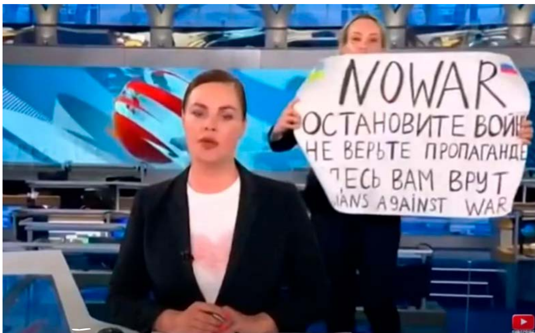
They're lying to you': Russian state TV employee Marina Ovsyannikova – later arrested – protests on air, March 2022.