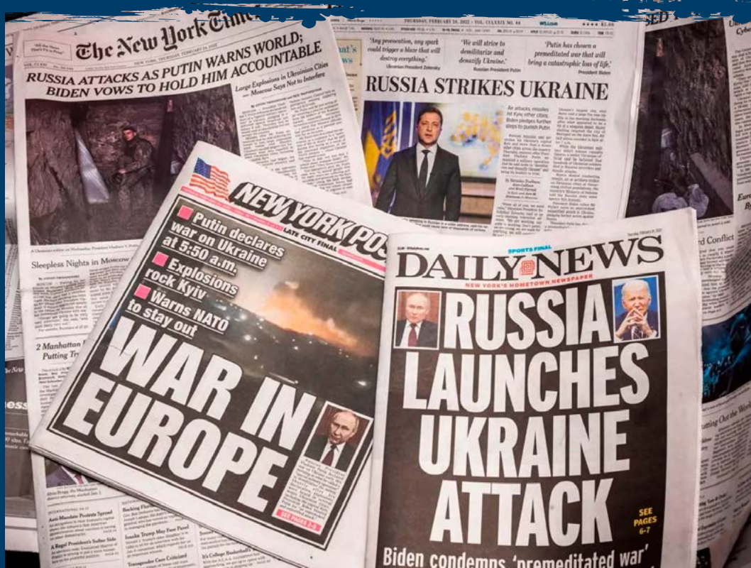
New York NY USA – February 24, 2022: New York newspapers report on the previous nights invasion of Ukraine by Russian military forces.

The focus of world attention and internal pressures for change may have had some impact, and there has been a marked improvement in the intervening period. In the 2023 index it was 79 out of 180 countries. RSF noted that since the invasion of 2022 Ukraine is caught up in an information war and "stands at the front line of resistance against the expansion of the Kremlin's propaganda system." 16