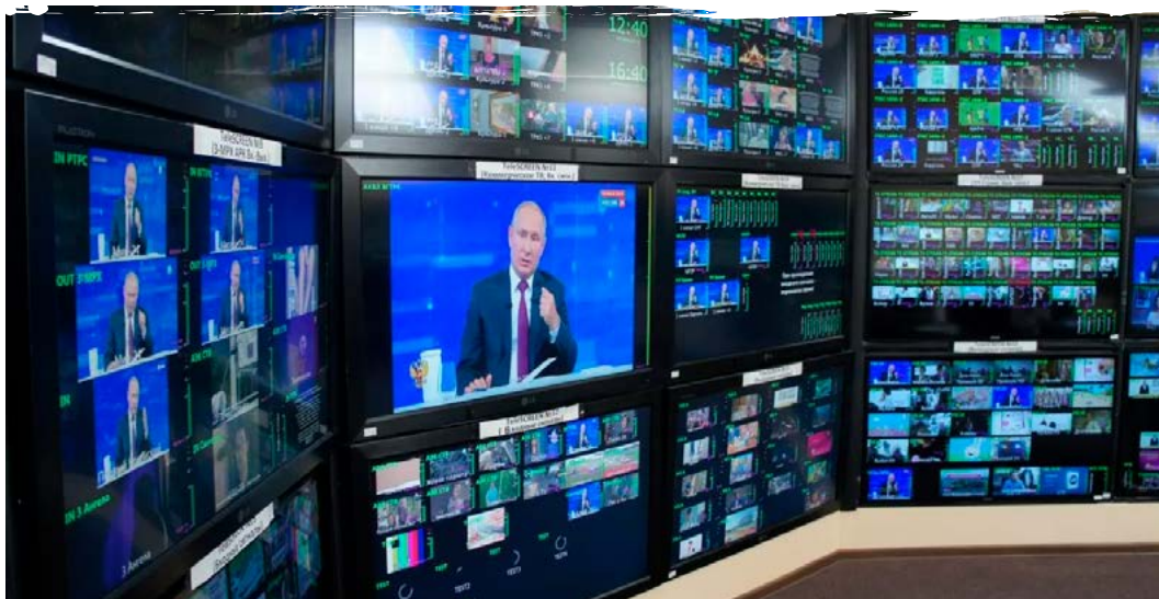
The President of the Russian Federation Vladimir Vladimirovich Putin at the annual talk with Russian people as seen in a live broadcast on many screens, June 2019.