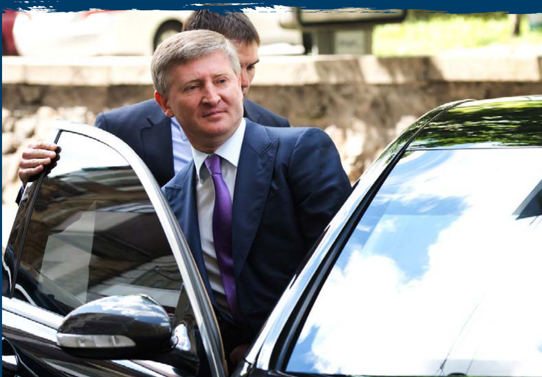
Rinat Akhmetov.

Akhmetov blamed a law passed by parliament in September 2021 to curb the political influence of oligarchs on his decision to exit his media businesses. However, analysts point out Akhmetov's media assets were loss making before the war, and too costly to maintain when coupled with the destruction of his Azovstal plant in Mariupol, other damaged factories and a 98 percent collapse in advertising revenue. 33