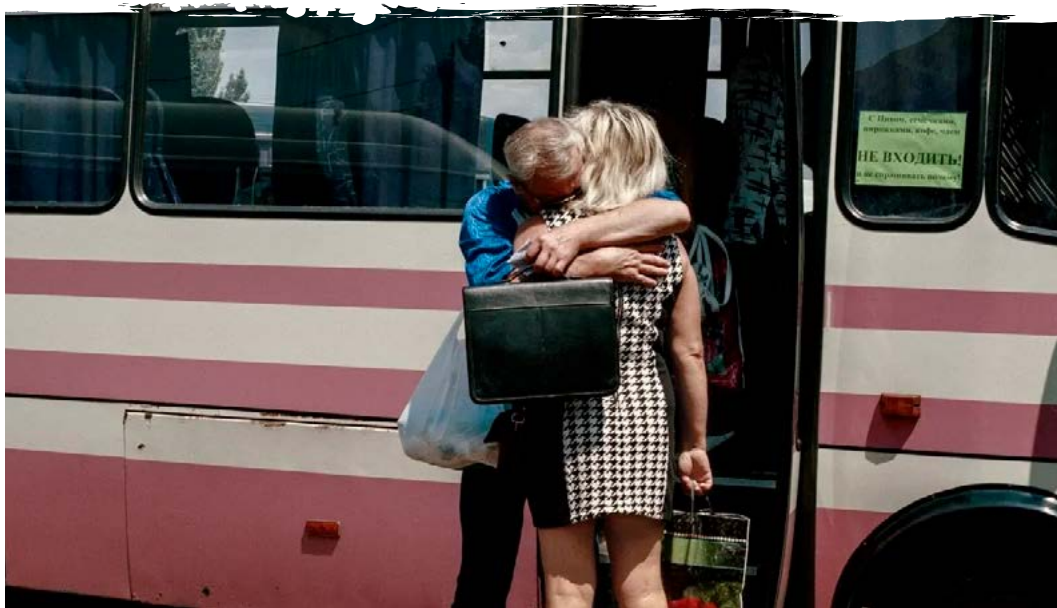
Donbas, Ukraine, 2019. A bus departing from Kurakhovo, a frontline town, to the entry checkpoint into the non-government-controlled Donetsk. After reaching the checkpoint, passengers will have to queue for many hours, in the middle of a minefield, waiting to cross. Despite harsh conditions, over a million people cross this line every month. One of the major reasons for traveling is to visit family members on the other side.