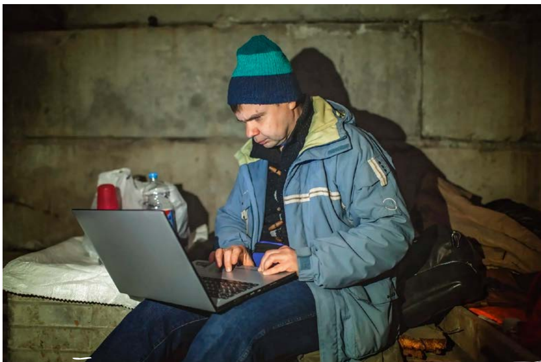
Ukrainian journalist sits in a bomb shelter with notebook, waits for the end of the air attack of Russian invaders, works and posts the latest breaking news. Kyiv Ukraine, February 2022.

Neutrality is neither a journalistic custom nor a virtue. Journalists are often partisan. Martha Gellhorn, George Orwell, Robert Capa and Andrée Viollis were not neutral during the Spanish civil war and even less so during the Second World War. "We must always take sides. Neutrality helps the oppressor, never the victim. Silence encourages the tormentor, never the tormented. You can't ask journalists to stop being human in order to be good journalists," Auschwitz survivor and Nobel Peace Prize laureate Elie Wiesel famously said. Impartiality doesn't mean inhumanity. As French-Swiss film director Jean-Luc Godard bluntly said, impartiality does not mean giving "five minutes to Hitler and five minutes to the Jews".