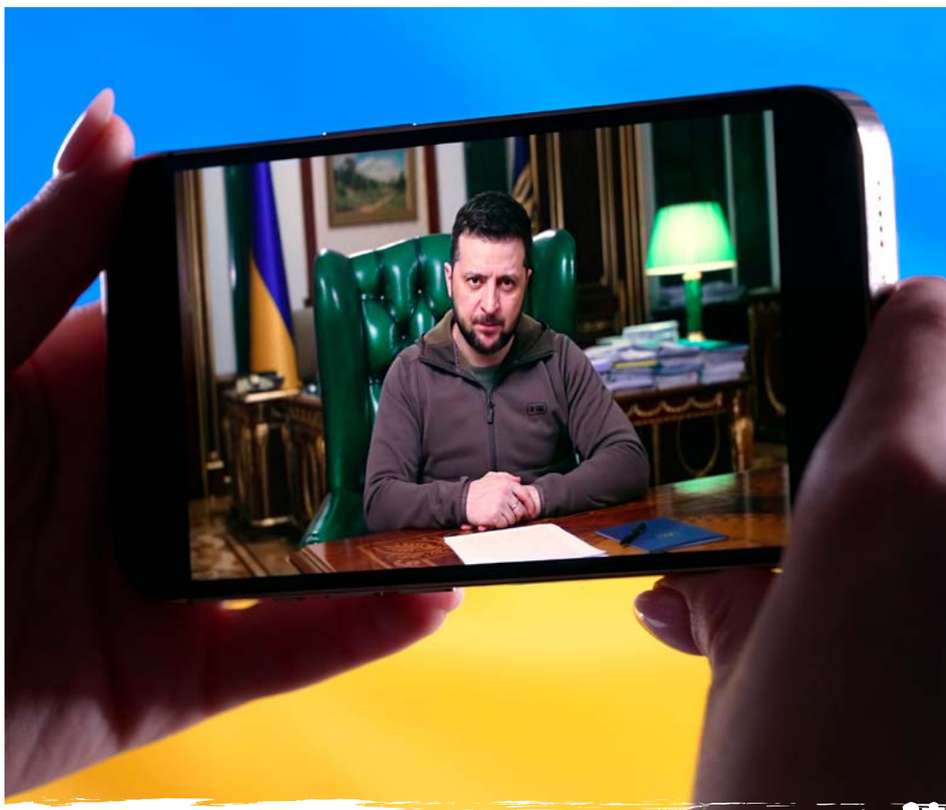
Online speech by President Volodymyr Zelenskyy on April 2022 from Kyiv, Ukraine.

Some commentators have questioned whether they are 100 percent authentic or simply part of the domestic and international propaganda war being waged by both sides which has effectively weaponised social media. 46 False and misleading videos claiming to be from the conflict were uncovered as part of a BBC investigation. 47