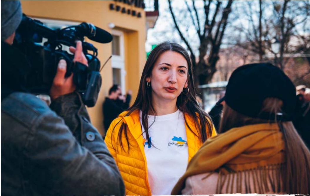
Female activist gives interview to Ukrainian TV channel, Uzhhorod, Ukraine in Apr 2022.

"We have for five years been trying to improve local media from this perspective and frankly we are at the very beginning of this process," he said.