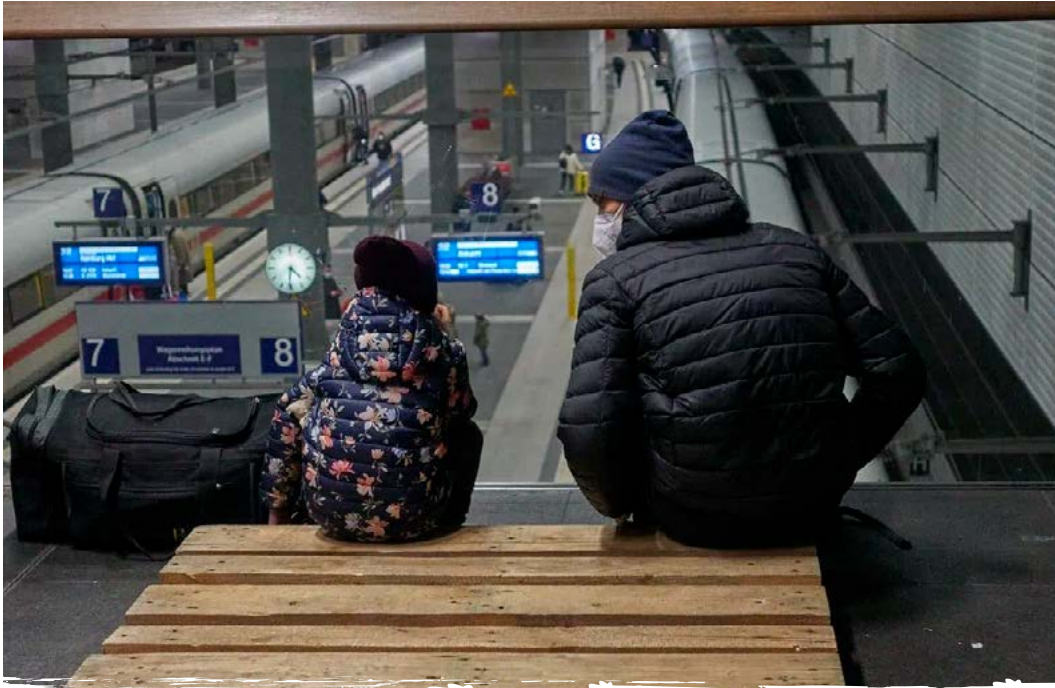
Ukrainian refugees at Berlin Central Station.

This series will highlight the importance to news media of the five core values of professional journalism as an antidote to propaganda and censorship. These are: