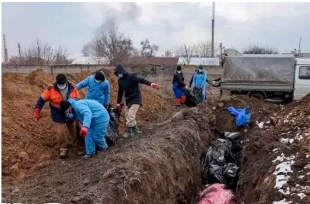
Mass graves return in war-torn cities.

There is a pressing need to strengthen the capacity of journalists, to help them report freely and to minimise the risks they face.