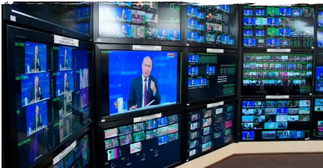
The President of the Russian Federation Vladimir Vladimirovich Putin at the annual talk with Russian people as seen in a live broadcast on many screens, June 2019.