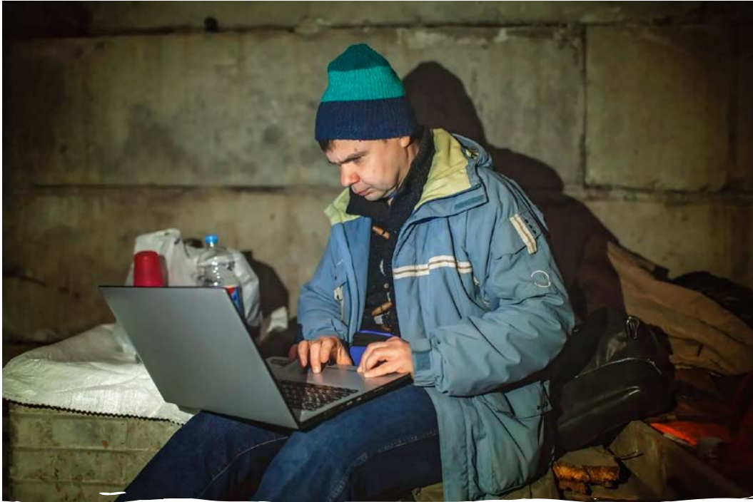
Ukrainian journalist sits in a bomb shelter with notebook, waits for the end of the air attack of Russian invaders, works and posts the latest breaking news. Kyiv Ukraine, February 2022.

Neutrality is neither a journalistic custom nor a virtue. Journalists are often partisan. Martha Gellhorn, George Orwell, Robert Capa and Andrée Viollis were not neutral during the Spanish civil war and even less so during the Second World War. "We must always take sides. Neutrality helps the oppressor, never the victim. Silence encourages the tormentor, never the tormented. You can't ask journalists to stop being human in order to be good journalists," Auschwitz survivor and Nobel Peace Prize laureate Elie Wiesel famously said. Impartiality doesn't mean inhumanity. As French-Swiss film director Jean-Luc Godard bluntly said, impartiality does not mean giving "five minutes to Hitler and five minutes to the Jews".