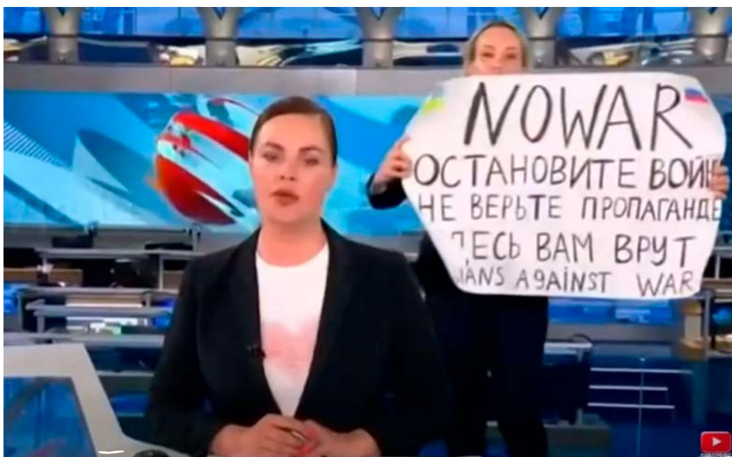
They're lying to you': Russian state TV employee Marina Ovsyannikova – later arrested – protests on air, March 2022.

"I want to take a photo that would stop the war," wrote Maksim Levin, a renowned Ukrainian photojournalist who was executed with a shot to the head by the Russian military on 13 March. 21