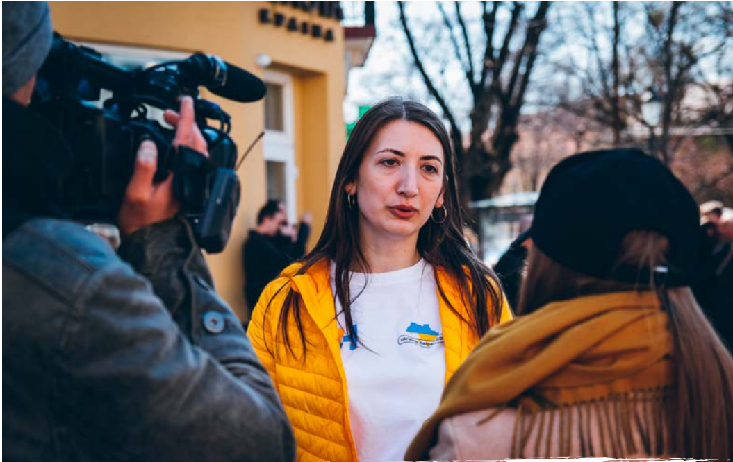
Female activist gives interview to Ukrainian TV channel, Uzhhorod, Ukraine in Apr 2022.

"We have for five years been trying to improve local media from this perspective and frankly we are at the very beginning of this process," he said.