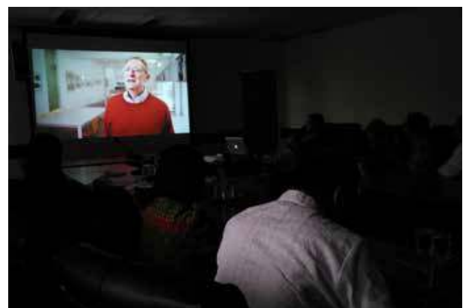
The EJN hosted a special screening of “Sea of Pictures” and a debate about migration coverage at the Indonesian Press Council, Jakarta