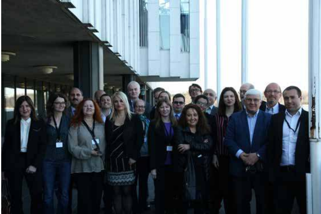
Helsinki 2016 Members of the UNESCO Building Trust in South East Europe and Turkey project meet at World Press Freedom Day celebrations in Helsinki, Finland.