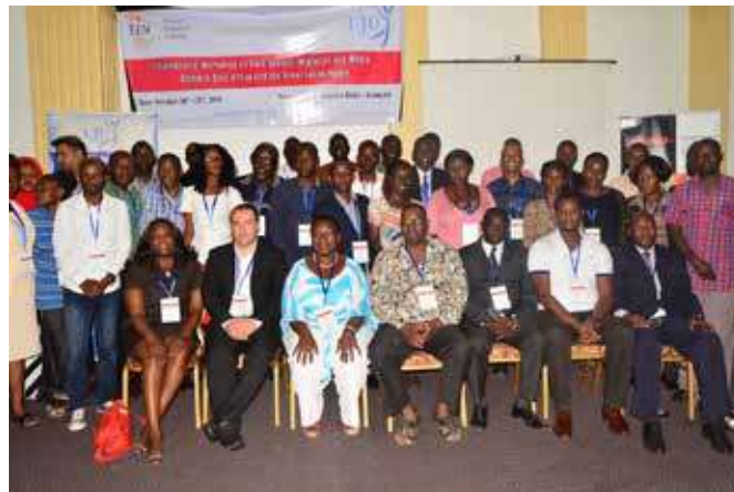
EJN workshop in Kampala on Combating Hate and Building Trust in Reporting of Migration in East Africa and Great Lakes