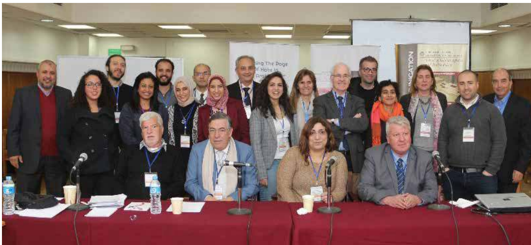
EGYPT 2016 Arab Regional Hub to Counter Hate Speech Meets in Cairo