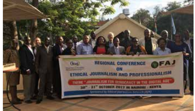
Conference. Ethical Journalism for Democracy in the Digital Age in Nairobi Kenya, 30-31 October 2017.