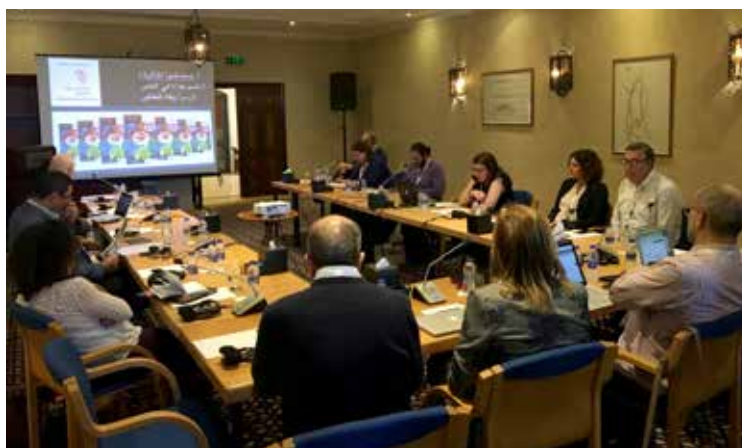
Left to right: Training for journalists from across Europe at UNESCO training in Bucharest; and The 2017 Meeting of the EJN's Arab Media Hub Against Hate Speech, Jordan, 2 December 2017.