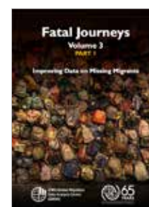
Publication covers from top left: Trust in Ethical Journalism; Ethics in the News; Egyptian Media Glossary on Hate Speech; Fatal Journey; Media and Trafficking in Human Beings Guidelines; and ICMPD Media and Migration Study.

media bias, hate speech and propaganda as well as over the issues facing East African journalism. The results of those meetings are attached to this report (See Appendix Three, Four and Five).