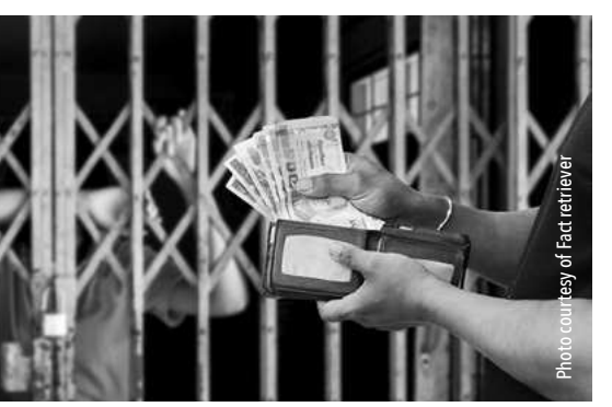
Human trafficking earns $9 billion to $31.6 billion globally.